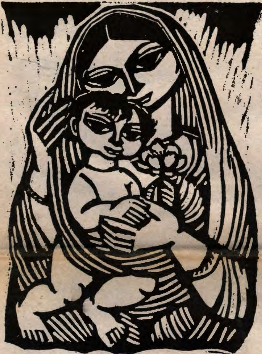
Chitaprosad of India