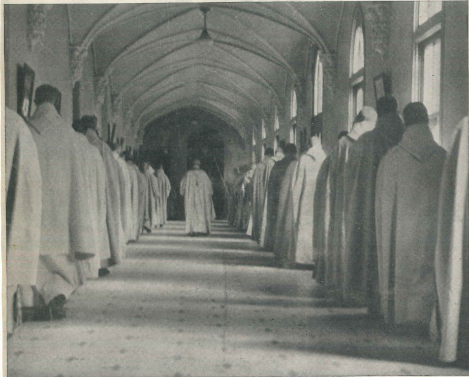
The Cloister: Monks in procession